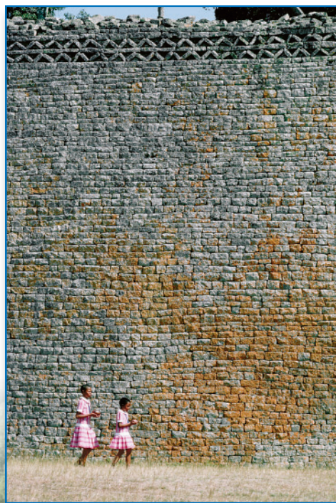
This picture of two girls standing next to a wall shows how very high the enclosing walls are.